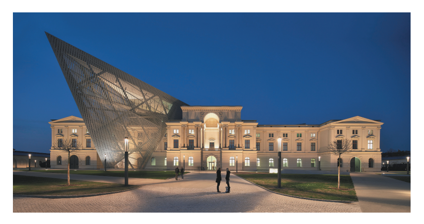
Figure 2. The Bundeswehr Museum of Military History, designed by Daniel Libeskind, showing the giant wedge violently perforating the classical building.

The result is a museum that still bears a resemblance to traditional museums as 'temples where national identities are produced and reinforced', but it also offers a forum that emphasises 'counterhegemonies, undecidability, contingency and open-endedness'. (Cercel 2018, 8, following the distinction by Cameron 1971). In highlighting that latter 'agonistic' aspect, the Dresden museum resembles some of the more innovative museums of the First World War (Cento Bull et al. 2019). There is, however, no direct engagement with the question of how the Cold War can be conceptualised – the conflict does not figure explicitly in the thematic sections, although the section on dual civilian/ military use is relevant in this context. The section on 'Protection and Destruction' includes the simulation of the explosion of a nuclear bomb by the artist Ingo Günther, 'which temporarily etches visitors' shadows to a phosphoric wall for a few seconds'. (Pieken 2013, 74). In the chronological sections, the Cold War becomes one episode for the history of the German Army (and to a lesser extent the GDR's National People's Army). The focus here is on its internal organisation as an explicitly democratic army, while also highlighting controversies, such as the debate about NATO's dual-track decision and the stationing of Pershing II nuclear missiles in the Federal Republic in the early 1980s (Pieken 2013, 79).