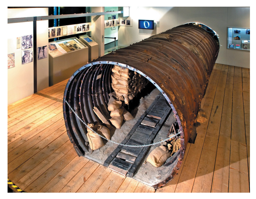
Figure 3. The escape tunnel in the Allied Museum, Berlin.

telephone kiosk; the Cold War played out in day-to-day life. Unsurprisingly, there are fragments of the Wall, but they are overshadowed by the large section of a so-called 'spy tunnel' (Figure 3). By these later stages of the display, the focus has turned to everyday street life and co-existence, the Wall (in images at least), military defence, and stories of escape.