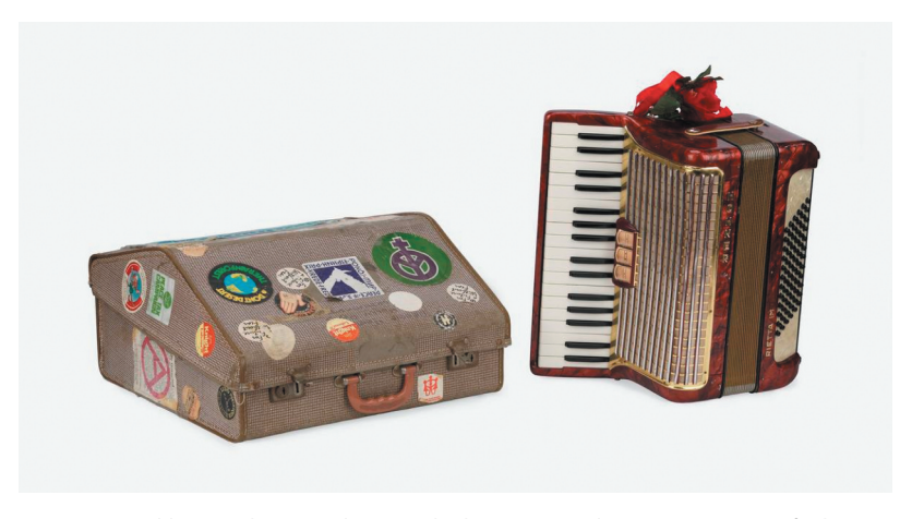
Figure 5. Peace protestor Debbie Handy's accordion, on display at Imperial War Museums Duxford.