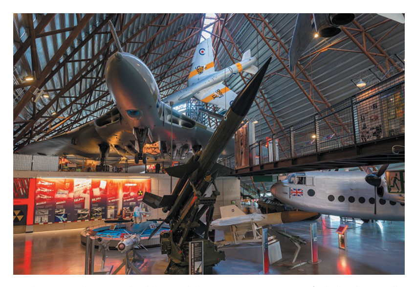
Figure 4. Aviation dominance: the National Cold War Exhibition at RAF Museums Cosford. The dramatically vertical English Electric over two of the three V-bombers.

On their way to the visitor centre, visitors approach the large and imposing hangar that houses the National Cold War Exhibition through a path flanked by aircraft used by the RAF until the 1980s. The steel building was custom built and completed in 2007 and 'made of two curvilinear triangles' (Lowe and Joel 2013, 170). Although not as dramatic as Libeskind's intervention in the Museum of Military History (Figure 2), the shape of the building symbolises simultaneously the importance of aviation, technostructures and technology for the Cold War, 'the fractured Cold War world' (Cocroft 2017, 227), and the threat posed by it. Inside, the £10 million display space is dominated by large technology, mainly by three V bombers (whose full extensions can only be glimpsed properly by taking the stairs up to a gallery that surrounds part of the display area) and a vertically displayed English Electric Lightning supersonic jet seemingly shooting towards the sky. All objects played a role in the deployment of the British nuclear deterrent prior to the introduction of submarine-based missiles in the mid-1960s (RAF Museum 2020b). Throughout, the description and explanation of artefacts is minimal and relies primarily on the use of the website to make sense of the 'gleamingly maintained' aircraft (Lowe and Joel 2013, 170–1). In terms of its chronology, the