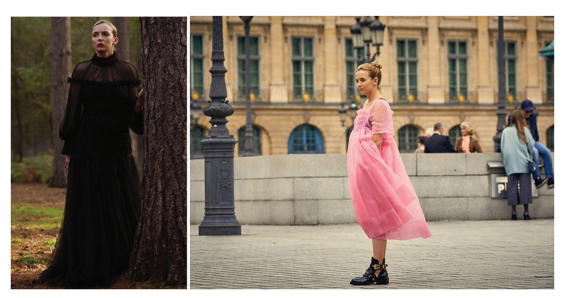
Figures 5 and 6: Villanelle dressed in Alexander McQueen (left) and Molly Goddard (right), Killing Eve, Seasons 1-3, 2018-20, UK.

Tall, lean and youthful, Comer functions as performer-model-celebrity as she effortlessly moves from TV drama to fashion editorial, in accordance with the trends and tensions within contemporary visual culture (see Church Gibson 2012). Despite the spectacle of costuming, there is a conspicuous absence of a verbalized fashion discourse within the series; instead, such 'written clothing' appears together with 'image-clothing' (to borrow from Barthes 1967/1990), in the copy of cross-media promotional editorials and user-generated content on blogs and social media platforms. Although many of the garments Villanelle wears are sourced designer fashion items from established and emerging brands, when they appear on-screen it is important to remember they are in fact costumes (also see Wolthuis forthcoming 2021: 10). The work of Killing Eve's costume designers Phoebe De Gaye, Charlotte Mitchell, and Sam Perry (for Seasons 1, 2 and 3, respectively) creates a visual narrative that supports characterization and the technical and physical demands of performance and production (see Stutesman 2011). Seemingly mismatched garments that should not go together create a tension that is intrusive and theatrical and also at times is humorous and tongue-in-cheek. There is not a stable image that 'is' Villanelle, rather, she exists as surface appearances, highlighting her fluidity on and beyond the screen.