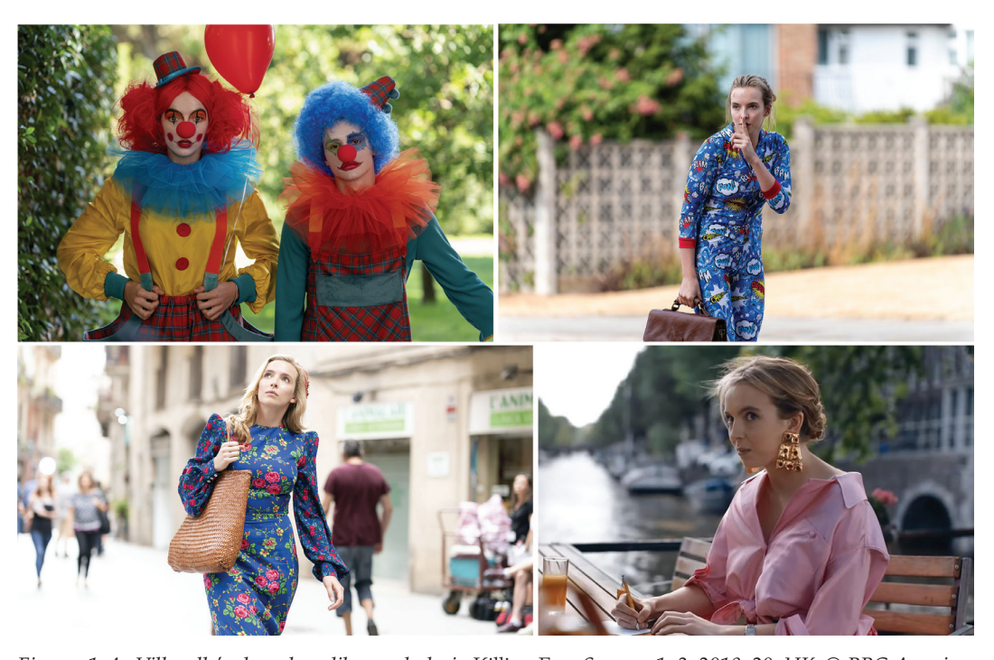
Figures 1–4: Villanelle's chameleon-like wardrobe in Killing Eve, Seasons 1–3, 2018–20, UK.