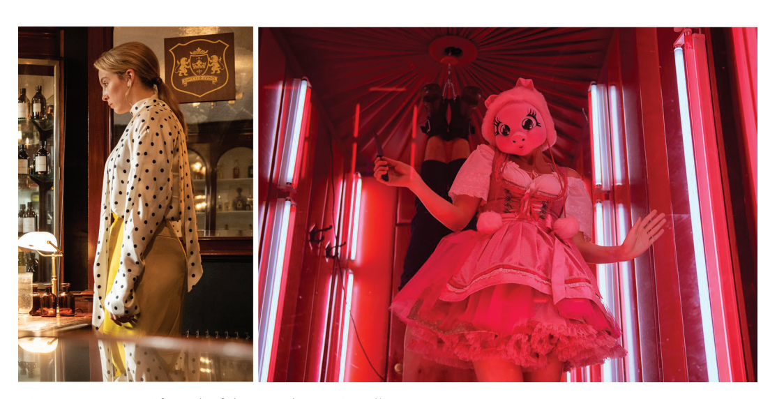
Figures 24–25: Artifice, playfulness and camp in Killing Eve, Seasons 1–3, 2018–20, UK.