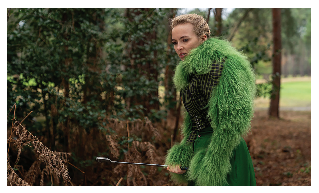
Figure 26: Villanelle in a Charlotte Knowles jacket, Killing Eve, Seasons 1–3, 2018–20, UK.

its very intangible and shifting existence as sign, theory and field of reference (2019: 15). Villanelle's visible disgust for instance, as she places her bare feet into the embellished (pseudo) crocs in the hospital, calls into question the playful trolling of fashionistas by Christopher Kane (SS2017) and Demna Gvasalia for Balenciaga (SS18). Villanelle may love luxury fashion, but a bejewelled croc (Minton 2018; Logan 2017; Wynne 2016) is perhaps a camp step too far.