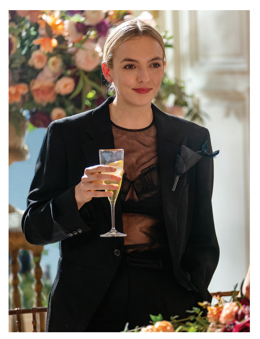
Figure 10: Villanelle's wedding suit, Killing Eve, Seasons 1-3, 2018-20, UK.

1975 photographs for French Vogue. Inspired by the 'mannish costumes' of iconic stars such as Dietrich and Garbo, Saint Laurent's reworking of the tux constructs a strong and determined image (Geczy and Karaminas 2013: 35; Gundle 2008; Bruzzi 1997), but it is one that is imbued with an intense eroticism. Villanelle's Commes des Garçon jacket is cut longer – whilst repeatedly referred to in the journalistic discourses as a tuxedo, it is a morning coat. Worn as men's lounge suits for leisure, the morning coat with its elongated tails is now more commonly reserved for formal occasions such as weddings. The flowing jacket skims the body and contrasts mannish tailoring with soft, translucent fabrics that draw attention to the body beneath, through the bustier blouse. To Saint Laurent, 'a woman was no less feminine in a pair