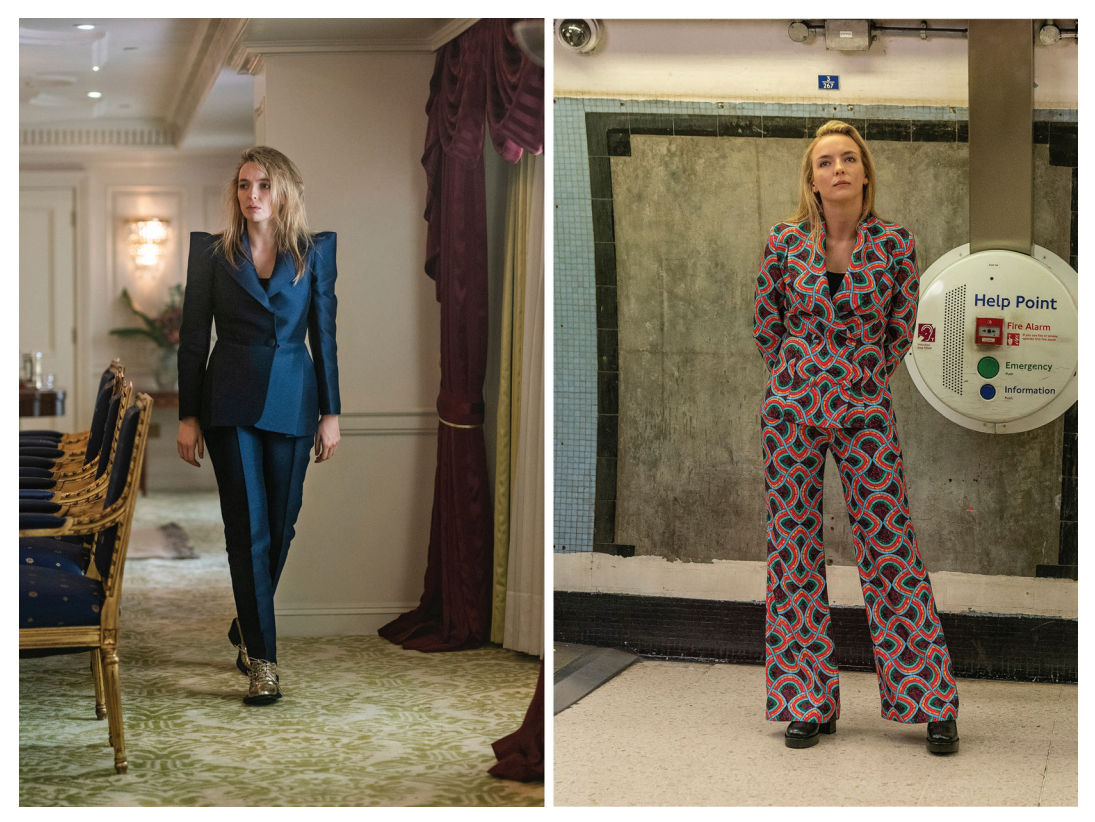
Figures 12 and 13: Queering suiting in Killing Eve, Seasons 1–3, 2018–20, UK.