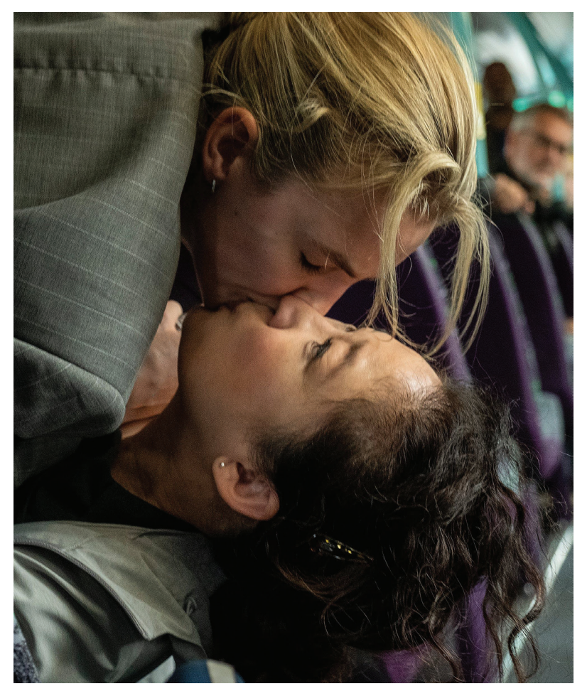
Figure 18: Villanelle bears down on Eve, Killing Eve, Seasons 1-3, 2018-20, UK.

Matter of Images, there is a 'discrepancy between symbols and what penises are actually like' (2002: 90). The visual symbolism of potent phallic power is not the same as the fragile, delicate penis that can get caught in a trouser zip. The suit, as Anne Hollander discusses, enables the material body to be recut into an idealized image, where the nude is 'even more natural when dressed' (1994: 90). Villanelle appropriates menswear as a new skin to recast herself as seemingly ever more powerful, phallic and sexually assertive. Through its volume, it creates a void between the materiality of the flesh and the structural and sculptural fabric form. Such sartorial spaces reconfigure, reconstruct and expand the frame of the body to create a hard, powerful suit of armour that acts as sartorial architecture (see Bruno 2014; Quinn 2003).