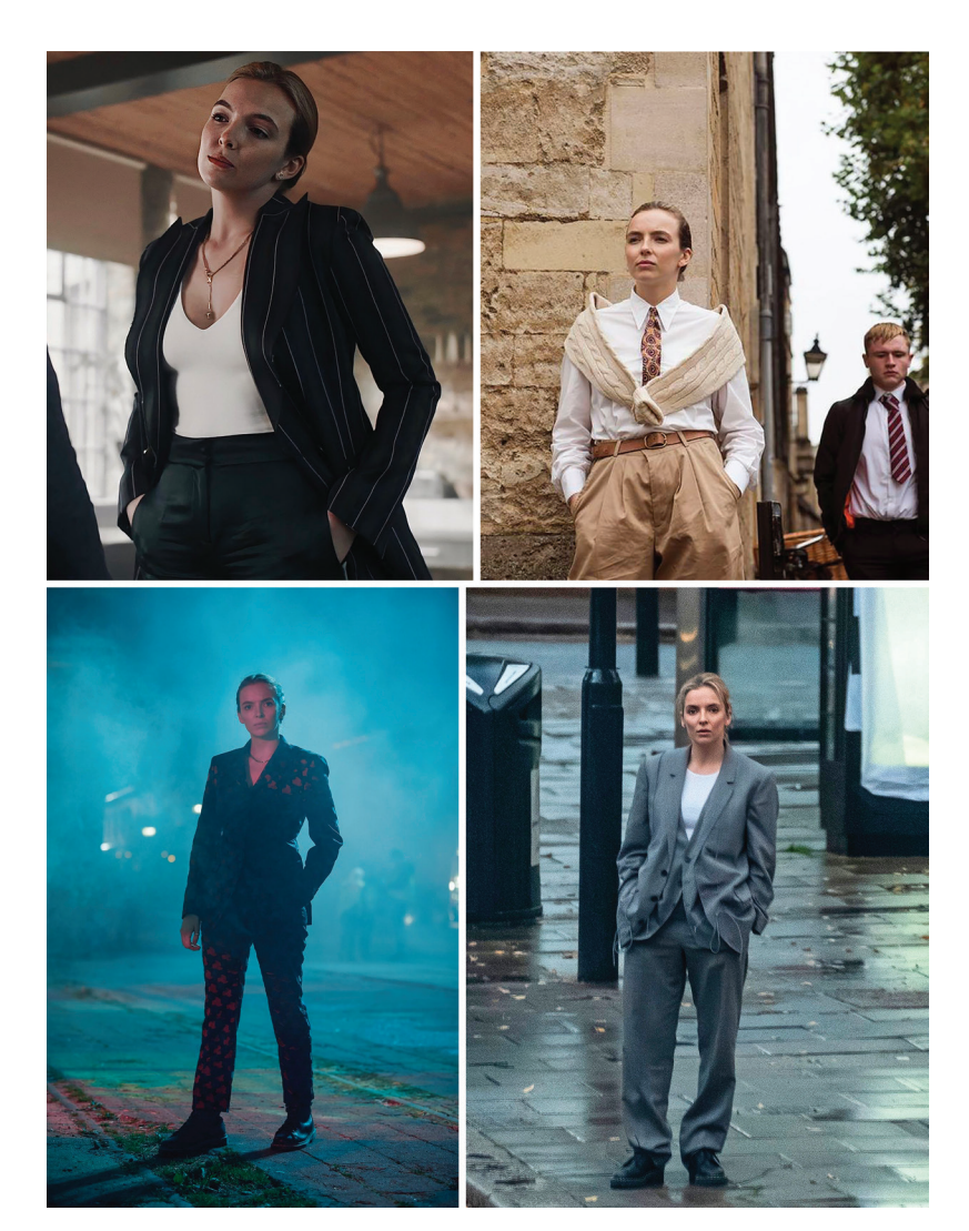
Figures 14–17: Villanelle's bold trouser pocket stance, Killing Eve, Seasons 1–3, 2018-20, UK.

power are displaced onto the hands. Like the 'sexually voracious and excessive' lionne, who 'dipped into the pool of male activity' (Geczy and Karaminas 2013: 26), Villanelle's assertiveness is also attractive.