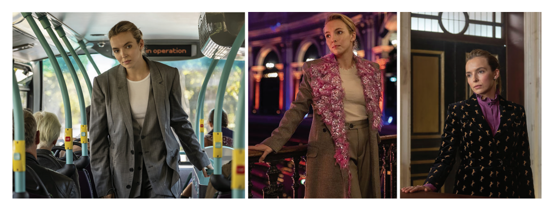
Figures 7–9: Villanelle's suited style in Killing Eve, Seasons 1–3, 2018–20, UK.

The eroticism of androgyny that permeates the representation of Dietrich, or Greta Garbo in Queen Christina (Mamoulian 1933) is characterized by a combination of glamour, clean lines and tailoring (Gundle 2008; Bruzzi 1997; Gaines 1989; Landy and Villarejo 1995). Through clothing and performance, Dietrich constructed herself as the 'point of multiple erotic identification' (Bruzzi 1997: 175), and this is exemplified by Villanelle's wedding outfit at the start of Season Three (see Figure 10). Her look is reminiscent of Yves Saint Laurent's (YSL) 1966 Le Smoking and in particular Helmut Newton's iconic