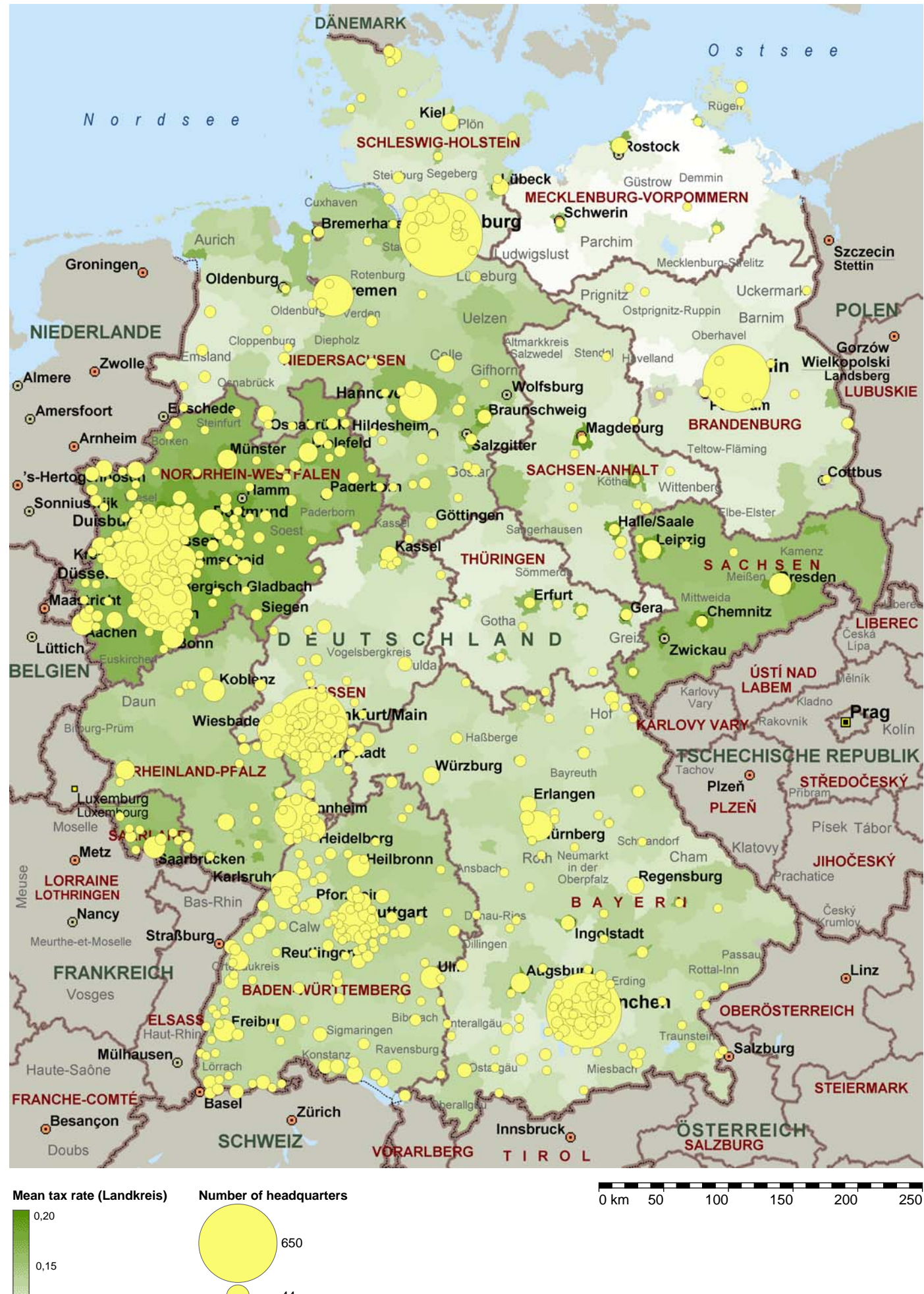
Figure 2: Geographical distribution of regional headquarters