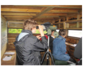
Viewing Areas and Hides. Some places can allow us to see the wildlife in ways that do not disturb the wildlife.

What do you think of these hides / these kinds of places for observation? How might the hides and viewing areas like these be improved? What might they to be like inside / outside? How would you change or improve them?