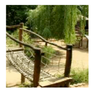
Paths, Bridges, Access. We can get closer to nature with good pathways whilst still leaving some places just for nature too.

What kind of paths might be useful for getting close to nature on a reserve? What makes a path inviting to use? What new kinds of paths or access would you like to see on a redeveloped reserve?