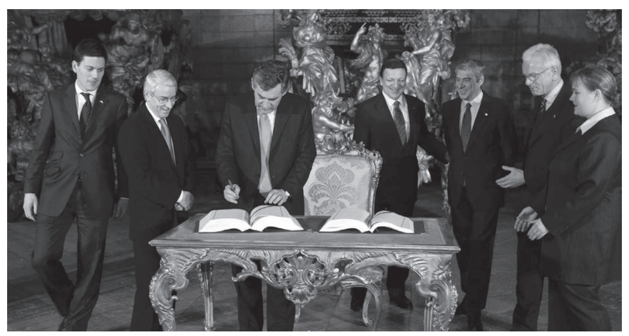
Signature of the Lisbon Treaty, December 2007

The Lisbon Treaty was signed in December 2007 by the leaders of all EU member states. It replaces the failed Constitutional Treaty<sup>19</sup> and amends the current Treaty on the European Union (TEU) and the Treaty establishing the European Community (TEC). The Constitutional Treaty was preceded by the Convention on the Future of Europe convened in 2002. Civil society groups played a key role during the Convention to ensure the introduction of many of the concepts which are now part of the Lisbon Treaty. Following the negative referenda in France and the Netherlands in 2005 which spelt the end of the Constitutional Treaty, an Intergovernmental Conference (IGC) was convened in 2007 which decided upon the text of the Lisbon Treaty. The negotiations on the new Treaty were largely closed to civil society groups, however, following adoption of the text there were calls for EU leaders to open up to people and NGOs to discuss the practical implementation of the new treaty provisions. <sup>20</sup> The Lisbon Treaty was due to come into force in January 2009. However, delays were caused by the failed referendum in Ireland in June 2008. A second Irish referendum was held on 2 October 2009,