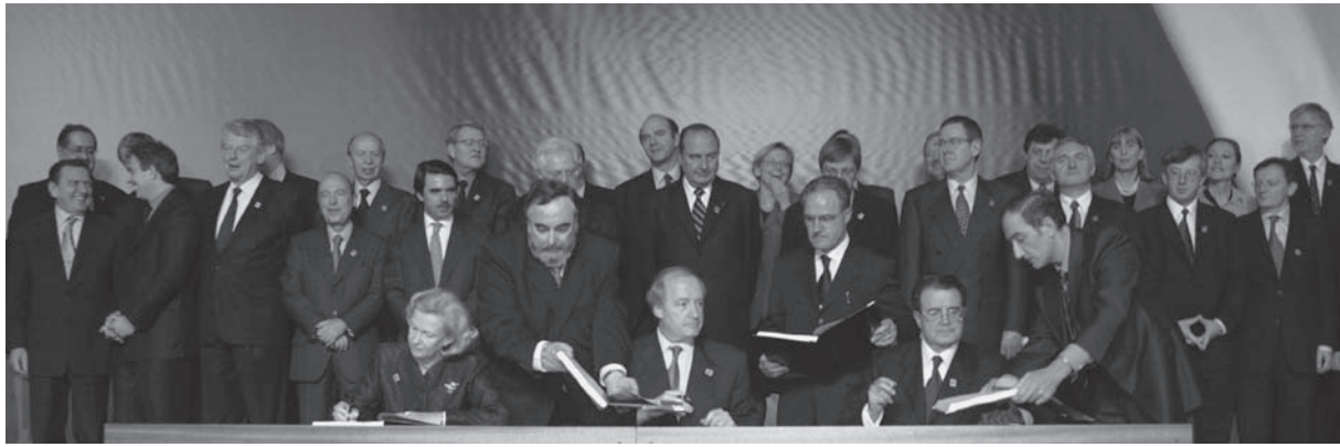
Signature of the EU Charter of Fundamental Rights, December 2000

The Charter was first proclaimed in 2000 in Nice and was then incorporated into the failed Constitutional Treaty. Sparked by the 50th anniversary of the United Nations' 1948 Universal Declaration of Human Rights, a debate began regarding the need for a catalogue of fundamental rights in the European Union. In an effort to increase the visibility of fundamental rights in the European Union through consolidation in a comprehensive document, the process leading to the development and adoption of the Charter was launched. The Charter's provisions have been influenced primarily by the European Convention on Human Rights but also by the EU Treaty, European Court of Justice case law, and the constitutional traditions of the member states. The Charter is contained in a separate document from the Lisbon Treaty but remains an instrument of soft law until the Lisbon Treaty enters into force. The Lisbon Treaty will give the Charter binding legal effect by the insertion of an amendment into article 6 which results in it having the same legal value as the Treaties. Despite this absence of legal effect so far, the European Court of Justice has referred to the Charter's provisions in an ever-growing number of cases. 16 It therefore remains to be discussed whether the Charter will add any value to fundamental rights protection and the fight against of racism and discrimination in the European Union.