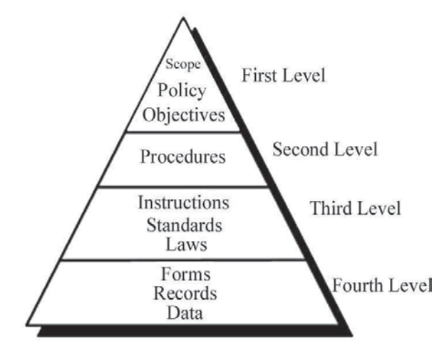
Figure 3. Documentation pyramid for OHSAS Standard.

Documentation provides evidence. Documentation is proportional to the level of complexity, hazards, and risks concerned and is kept to the minimum required for effectiveness and efficiency. The basis of the documentation is shown in Figure 3.