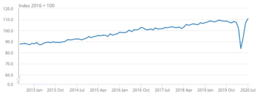
Volume sales, seasonally adjusted, Great Britain, July 2012 to July 2020

Source: https://www.ons.gov.uk/businessindustryandtrade/retailindustry/bulletins/retailsales/july2020#retail-sales-during-the-coronavirus-pandemic