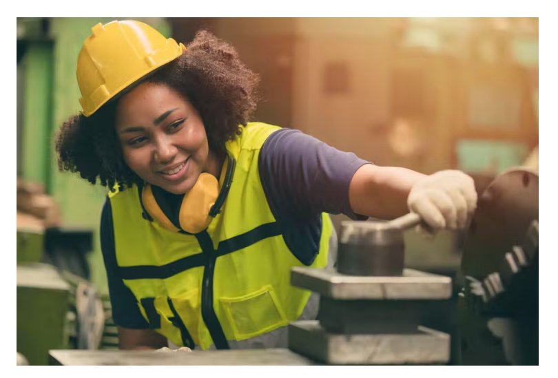
Better apprenticeships are vital for productivity.

The question is how to encourage firms to release this investment potential. The government is planning to increase headline corporation tax from 19% to 25% in 2023, which is not going to help and should arguably be scrapped. To further incentivise investment, there's also a need for more generous rules around tax relief, including extending the "super-deduction" that was brought in two years ago, which can reduce companies' tax bills by 25%.