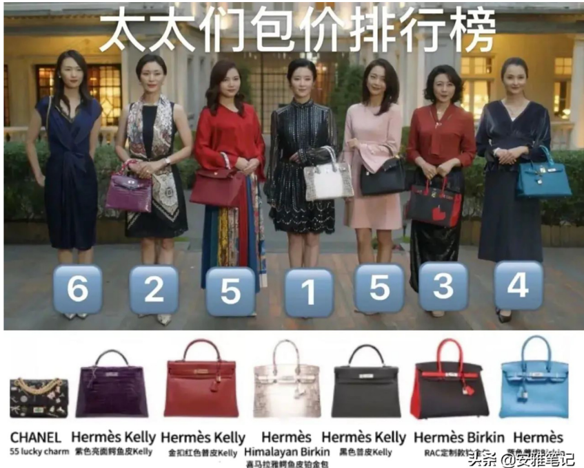
Figure 6: 富太太们 ('rich wives circle') in Zhang's Nothing But Thirty .

understood that the rich wives must alternate their Hermès bags to prove that they actually have access to an ever-moving (cinematic) series of these object-(advertisi)ngs.