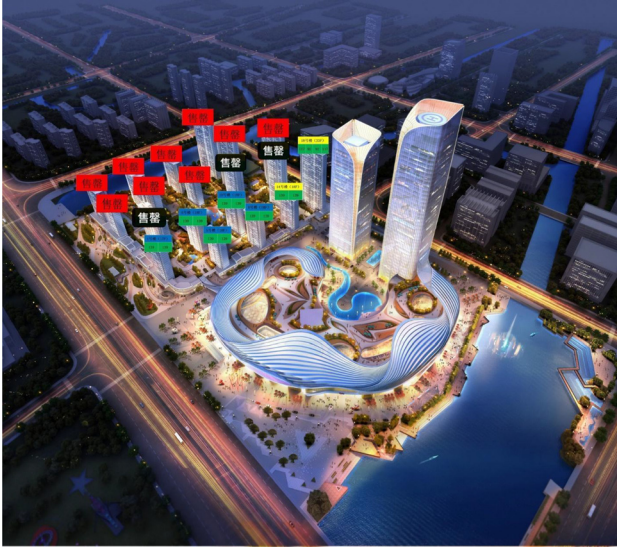
Figure 1: Simulated (un)real estate products.