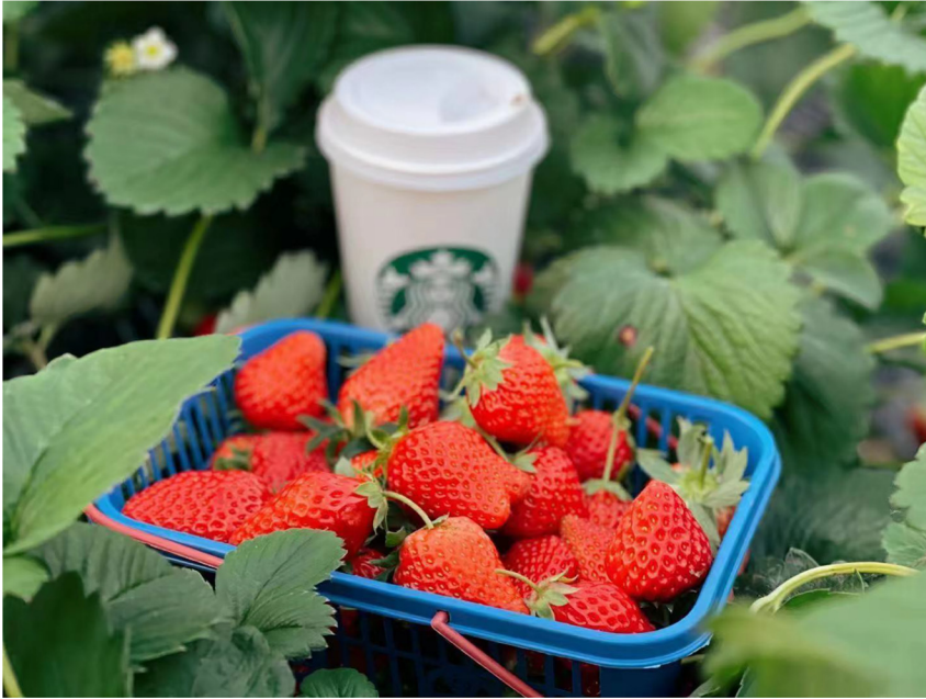
Figure 3: “Today’s strawberries were especially big and sweet”.

littered nature cannot be excluded as a possible horizon of meaning within the composited shot (it is worth noting that there is not yet—at time of writing—a Starbucks anywhere nearby this landing strip, suggesting this prop has been shipped-in with her and is likely empty), we feel that the cup’s vertical arrangement and centralised (near vanishing point) location within the still life composition signal it is an example of important prop and sign. As per our engagement with selfies and other film-making behaviours in Chinese Urban Shi-nema , we would suggest that the image and text-message combo (as part of a longer narrativised stream of biographic images) demonstrates our phone-camera-operator emerging as something of a set designer, montager, scriptwriter, director and absented star of the scenes she constructs – which draw and project self-associations to her (imagined) community of viewers. For, while these are not strictly speaking adverts for the consumable food, drink or space itself, one senses that the purpose of this image is to circulate as part of a longer drip-fed advert for the lifestyle of the “fractal celebrity” taking and arranging it (see e.g. Beller 2021, 102ff).