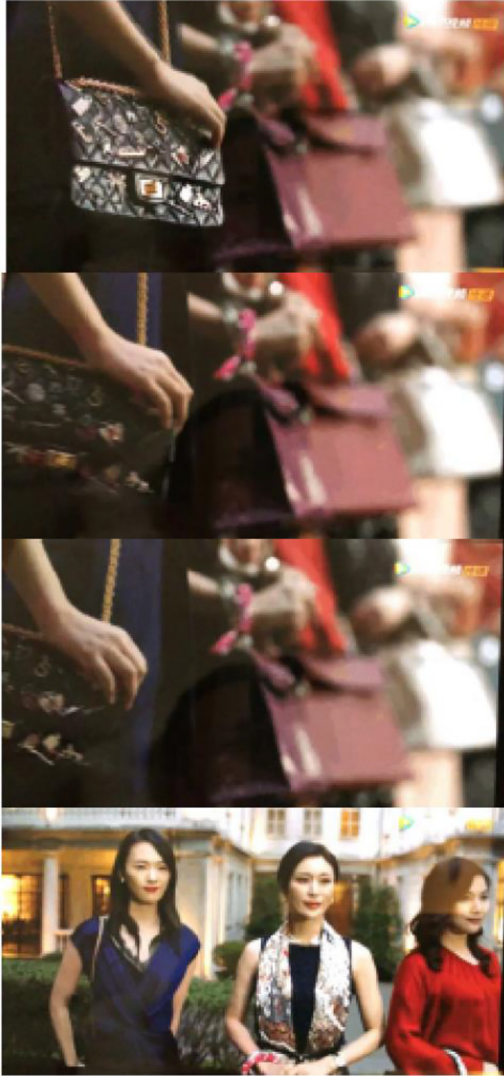
Figure 5: Gestures of shame in Zhang's Nothing But Thirty .

shame is to become a literal non-image, deemed a void unworthy of attention, in part due to the lack of (adverti)signs she is able to mobilise and display. Understanding this, she resolves to purchase a Hermès bag to gain access to the magic circle of rich wives (Futaitaimen). Commentary online made during this apotheosis appears to pity the fictional character, though, noting that when she does eventually manage to purchase a handbag by “blowing up” her credit cards and mobilising her Guangxi network, her success can only be fleeting. It is well