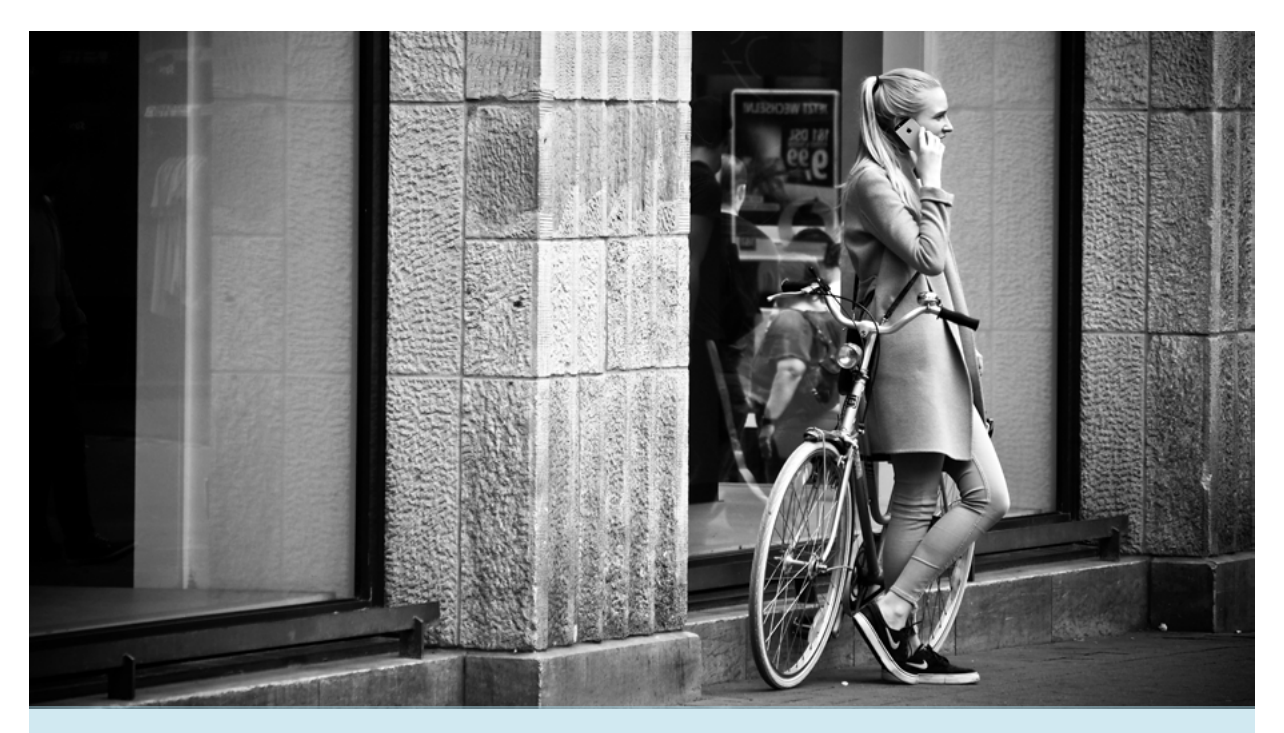
Active Travel Plans will be central to the design of future communities as well as enhancing existing ones

car-dependent developments. The Position Statement confirms that the Scottish Government will build on this review and apply the Place Principle to re-imagine city and town centres, promote them as live-able places and diversify and balance the use of land and buildings in town centres so they benefit all people and stimulate investment. This is a positive and helpful basis and our three recommendations clearly align with this, but we suggest developing some ideas further.