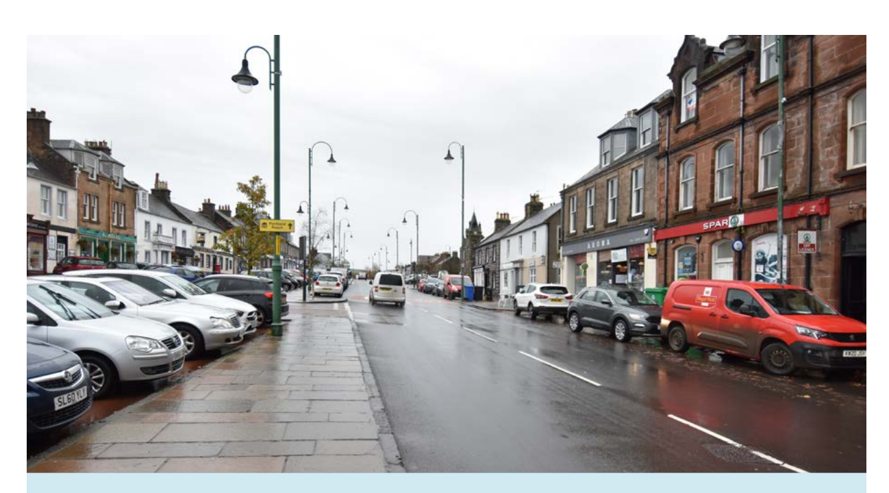
Considering people, place and planet is vital. Pictured is Biggar town centre

a key role for the third sector and community organisations, with expertise in engagement methods including co-production, accessible processes, community development, and with networks that go deep into communities to reach and support those marginalised.