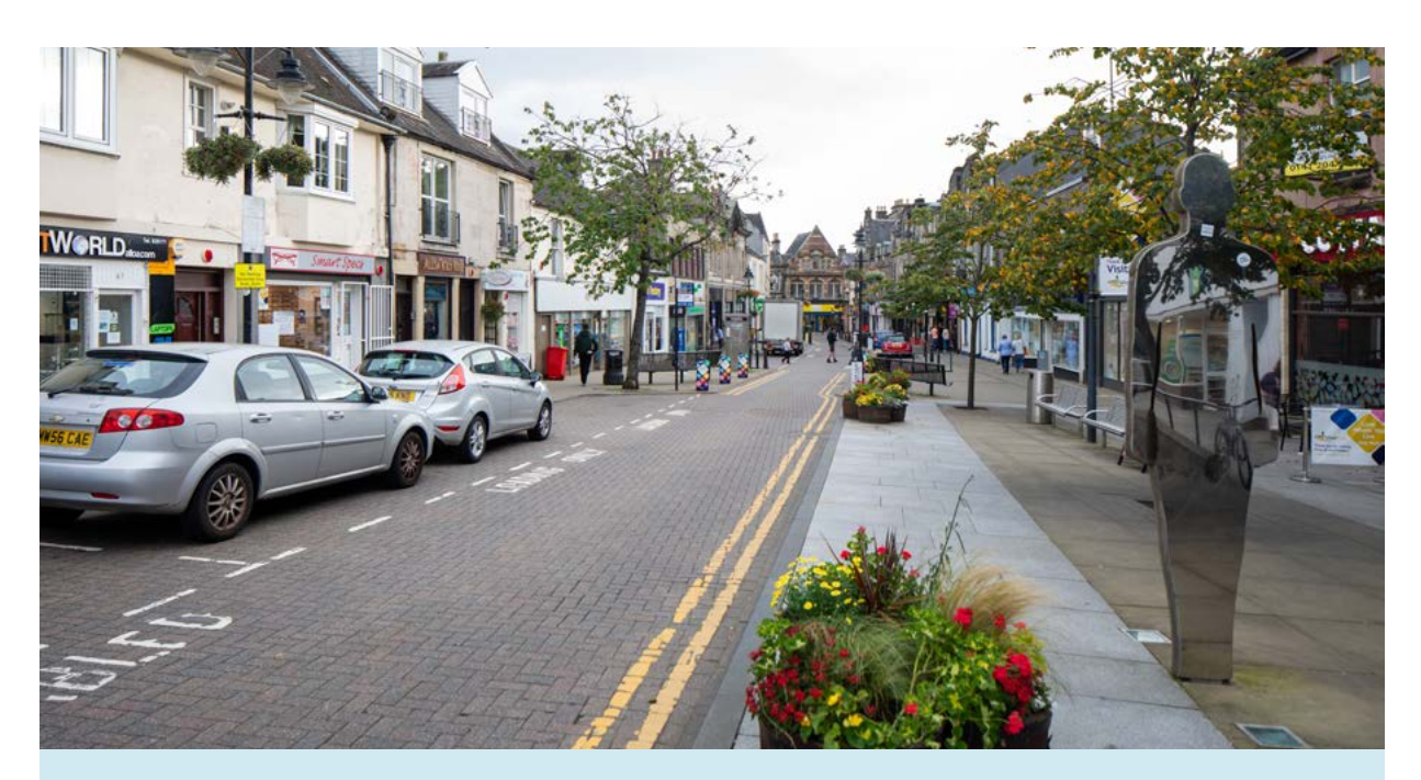
Diverse and mixed uses evident in Alloa town centre, where Alloa First has spearheaded support for local businesses.

everyone and everyone has a role to play in making their own town and town centre successful". Towns and town centres are very well placed to deliver on the national ambitions. They are the heart of communities. They can provide shared and equitable access to products and services, have an ability to focus sustainable and local economic and social activity and can deliver enhanced wellbeing through a positive sense of place, history, community and environment.