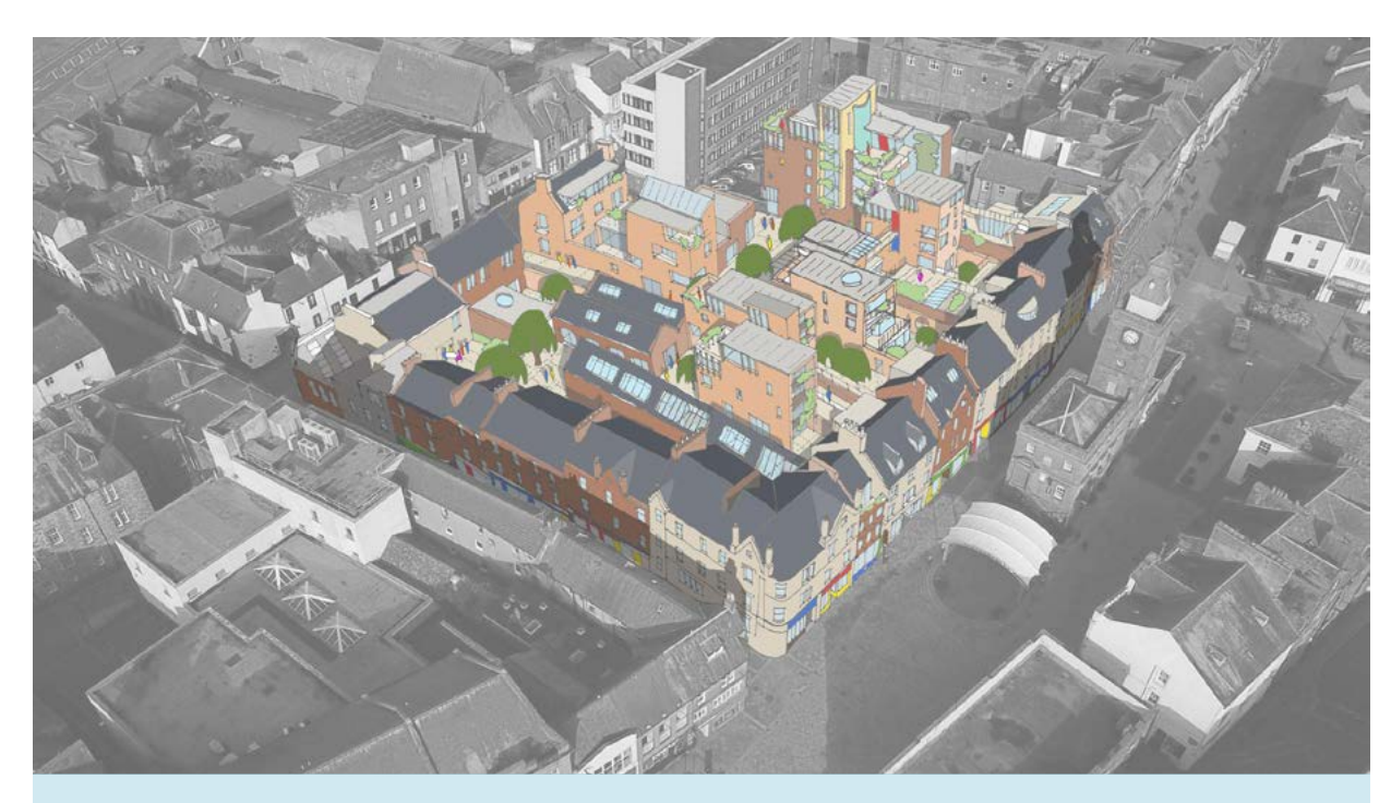
The Midsteeple Quarter project in Dumfries - an excellent example of community innovation