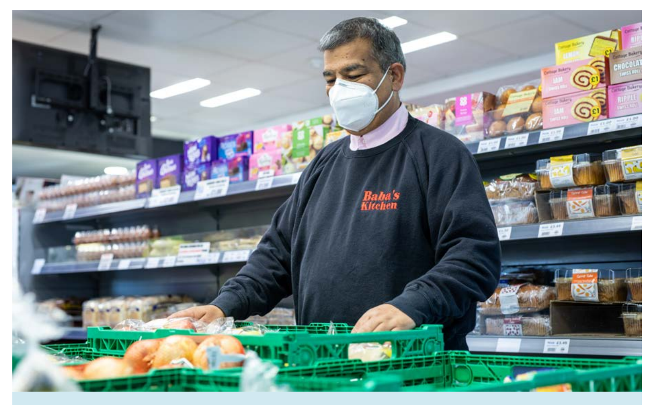
Covid-19 has had a major impact on businesses and in shaping the future

during the pandemic. It is one on which to build, as demonstrated further in the retail and town centre context by the very well received and supported Scotland Loves Local<sup>29</sup> campaign of 2020 and the Towns and Business Improvement Districts (BIDs) resilience and recovery funds<sup>30</sup>.