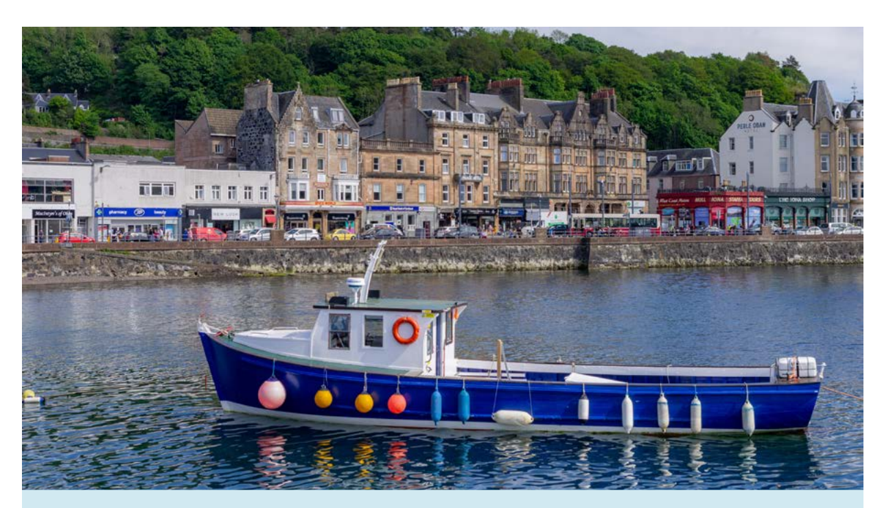
Tourism and attracting visitors is vital to the future of many towns like Oban

Centre Action Plan enterprising communities has perhaps had the least attention and shown the least progress. This may be due to the lack of community and local involvement in decisionmaking and opportunities. Across all the themes and projects however the same two questions re-emerge; why are these examples not followed more widely and how can we get more rapid and broader development?