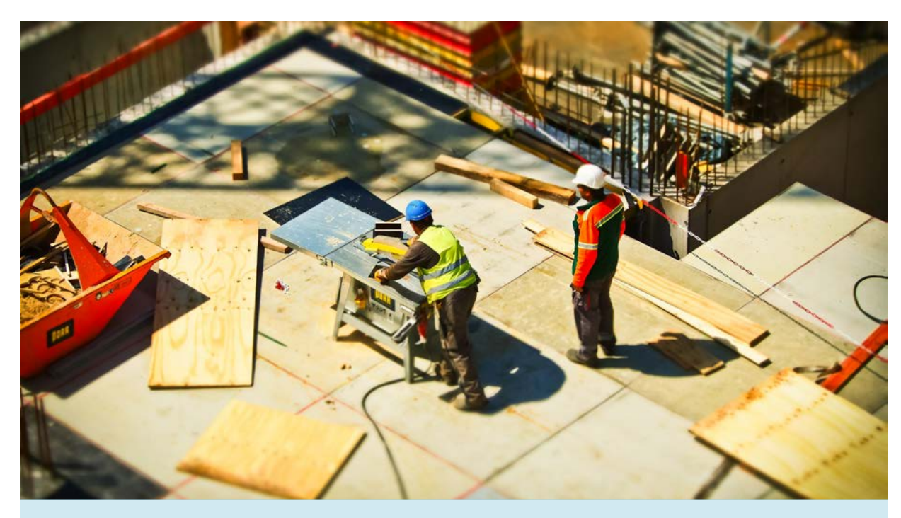
Why should new build development have a lower VAT rate than redevelopment?

centres have been deserted by many uses and the intention is to rebalance the situation and thus help reduce inequalities of access.