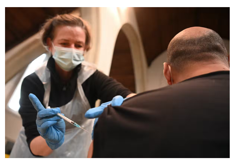
Getting the COVID vaccine booster will help protect the economy.