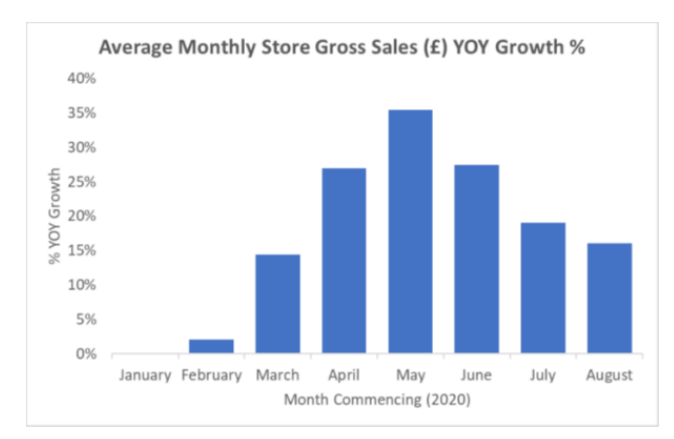
Figure 2. Average Monthly Store Gross Sales (year to year % growth).

Contextualising these observations within the situation of the whole convenience stores sector (Association of Convenience Stores, 2020) supports this sector's consistency, irrespectively of the kind of the investigated stores. The reason for that is the fact that almost 50 % of respondents claimed that average basket spend in 2020 increased to a large extent and 29 % reported increase to a small extent. At the same time, only 23 % stated that there was a decrease in the average basket spend (to a large extent 17%, a small extent 6%).