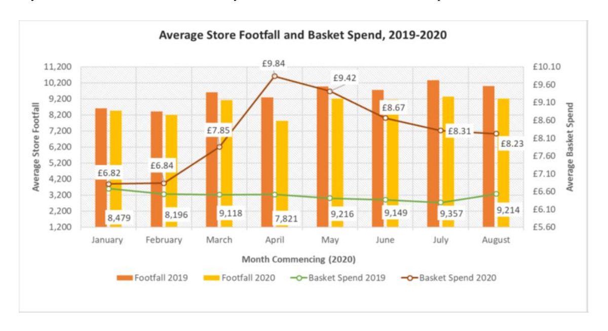
Figure 1. Monthly average footfall, Basket Spend and Sales (January - August 2019 and January - August 2020).

These observations are supported by the survey data concerning the whole convenience stores sector presented in the Local Shop Report 2020 (Association of Convenience Stores, 2020), stating that 40 % of respondents reported decrease in 2020 footfall to a large extent and a small extent 17 % of respondents (in comparison with 2019). At the same time 14 % of respondents admitted that 2020 footfall increased to a large extent and a small extent 23 %, all in comparison with 2019.