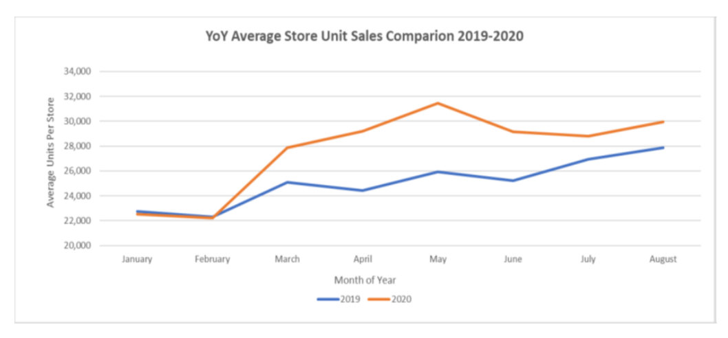
Figure 3. Average Store Unit Sales (year to year comparison 2019 – 2020).