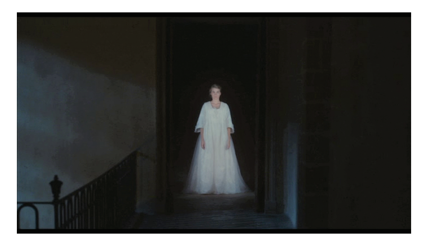
Figure 3. Héloïse as apparition in the wedding dress in Portrait de la jeune fille en feu (Pyramide Distribution).

between white and blue on the chromatic scale (see Figure 3). As well as recognising the figure of Héloïse to be an apparition, we also know that the dress cannot exist, as Sophie informed Marianne shortly after her arrival that Héloïse only has one dress (the green dress I discuss in more detail below) and still wears her convent clothes.