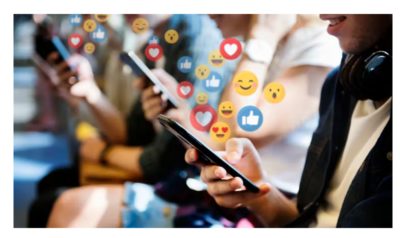
The UK government's proposed online safety bill promises 'a light touch' approach.

Traditional propaganda is now joined by attempts – as Donald Trump's one-time adviser Steve Bannon put it – to "flood the zone with shit" as a way of spreading distrust. These things destroy knowledge and result in uneven participation, especially with some voices elevated by "bots" – computer programmes masquerading as humans.