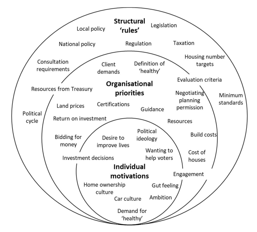
Fig. 3. Summary of issues at different levels that appear to affect urban development decision-making and population health outcomes.