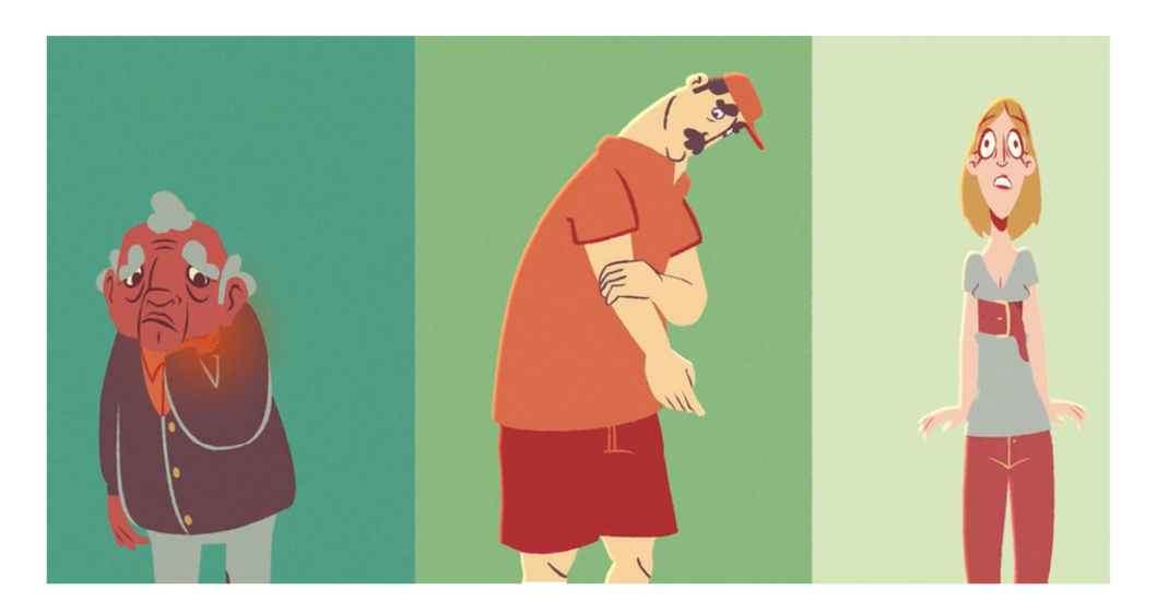
FIGURE 1 Example screenshot of animation