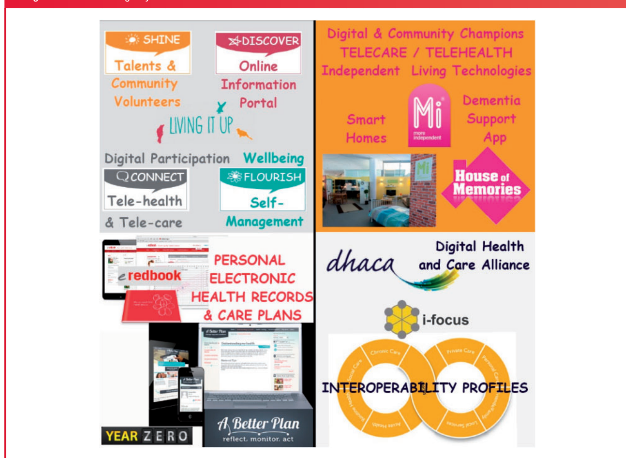
Figure 1: The 4 multi-agency dallas consortia.

University of Glasgow ethical approval was granted for this study. All respondents provided consent for participation. Identities are protected